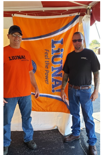
Labor Fest— Neenah