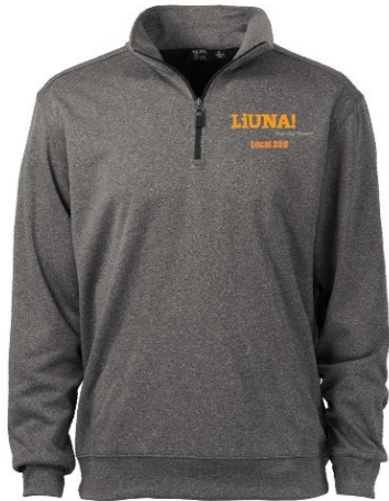
Men's 1/4 Zip Pullover Heather Charcoal S-4XL 6.25 oz, 100% Polyester With solid lining, heather exterior Water repellent Made in USA