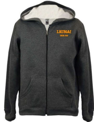
Men's Full Zip Fleece Hoodie Charcoal S-4XL 10 oz., 80/20 Cotton Polyester 3 pc hood for a more rounded look Spandex ribbed cuffs and hemline Made in USA